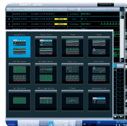
Menu of review screens